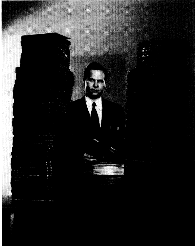
FIGURE 4. In this photograph Peter Goldmark grimly demonstrates data compression: the small stack of LPs in the center contains the same music as the two large stacks of 78-rpm records.

new record formats stimulated interest in music and reawakened the desire to have as full an experience of music at home as in live performance.