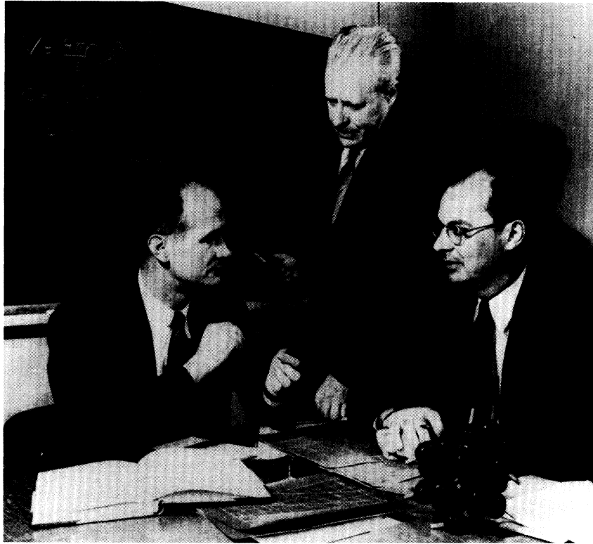
FIGURE 3. William Shockley (left), Walter Brattain (standing), and John Bardeen received the Nobel Prize in 1956 for their invention of the transistor.

program computers were under construction in many places—the EDSAC by Maurice Wilkes at Cambridge University, the BINAC by Presper Eckert and John Mauchly at the University of Pennsylvania, John von Neumann’s computer at the Institute for Advanced Study in Princeton, and others—but, as with the transistor, several years would pass before computers attained commercial success. Computers, too, would over the next decades have enormous influence on the development of signal processing.