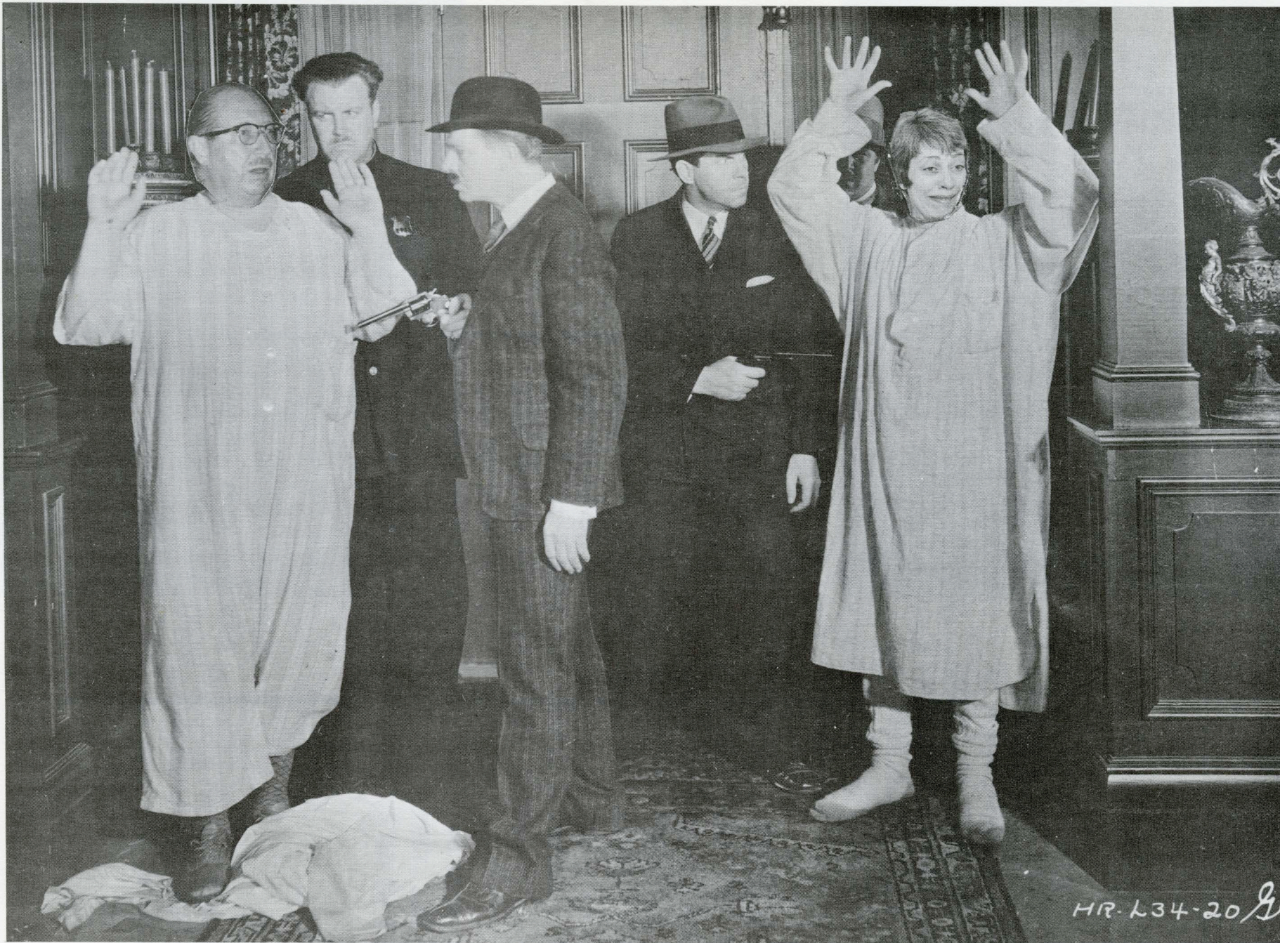
AND YOU SAID IT WAS A BOARD OF DIRECTORS MEETING IN SAN DIEGO!